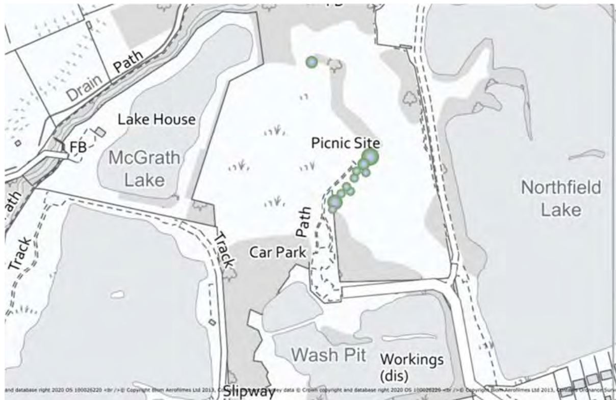
Figure 1 – Connective group planting at Poulner Lakes