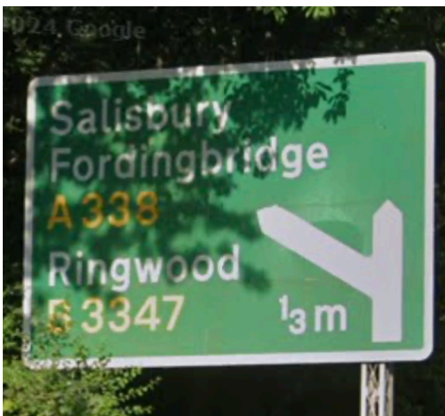
Exit signage for Ringwood