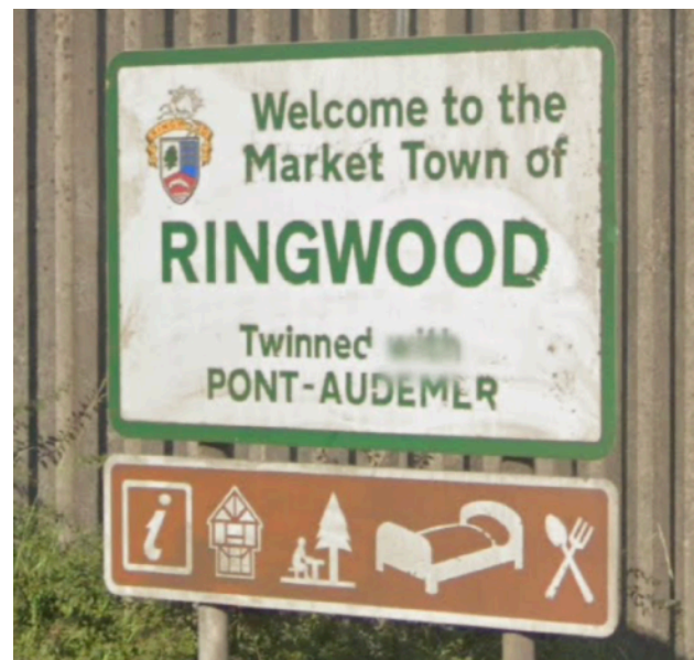
Marking the fact that the A31 passes through Ringwood (Westbound only)