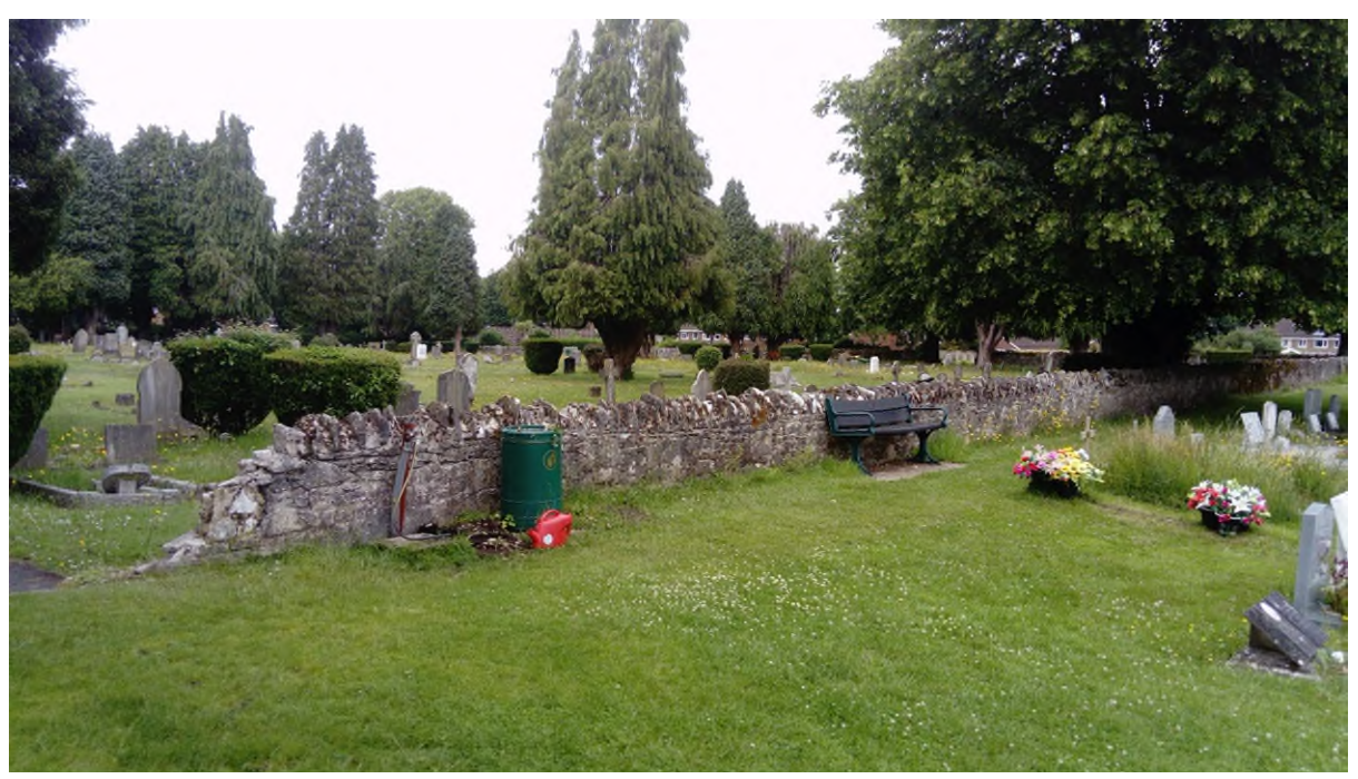
\overline{\textit{Figure } I-\textit{Proposed location of new columbarium wall}}