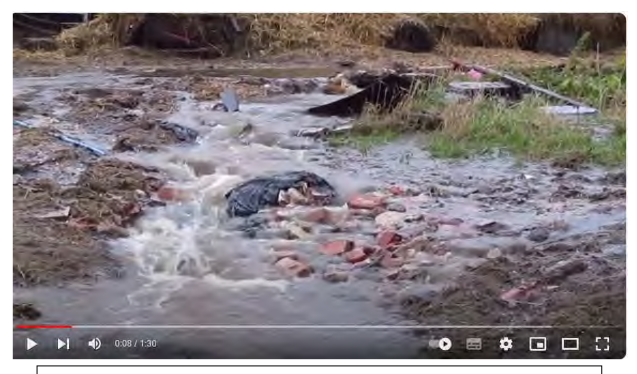
Lynes Farm, water ingressing from Nouale Lane