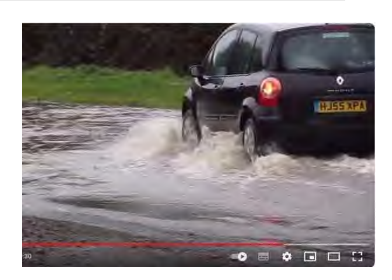
Lynes Farm flooding 2019