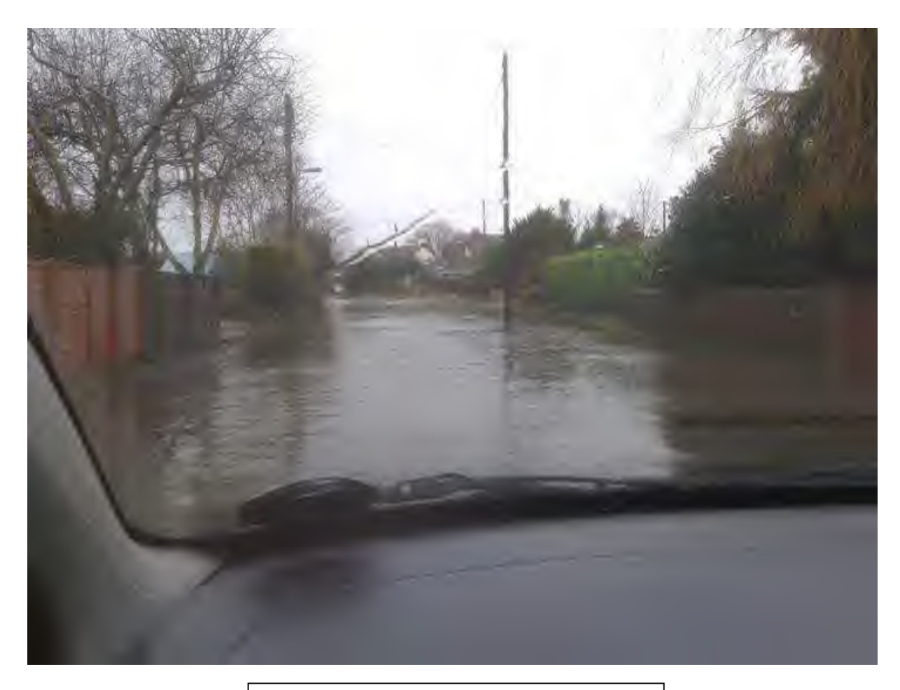
Flooding at the northeast corner of the site 2018

The Beaumont Park experience inevitably raises concerns about Lynes Farm.