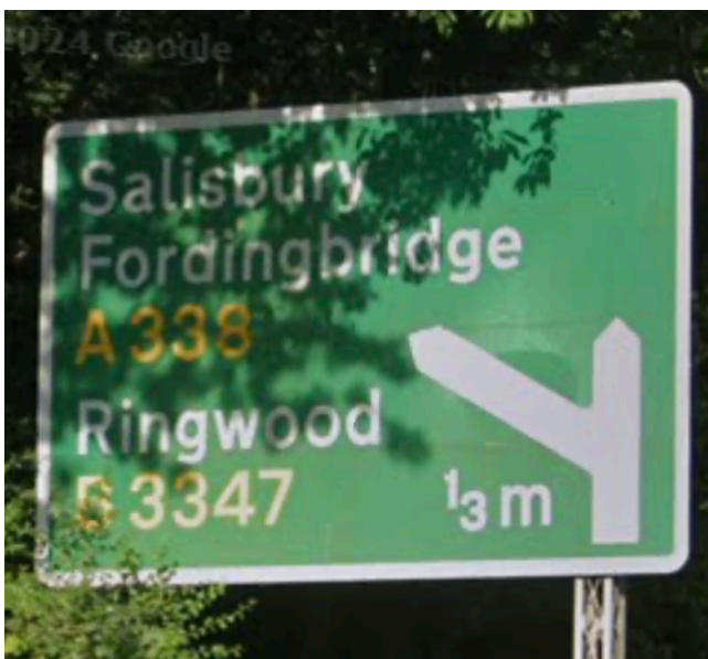
Exit signage for Ringwood