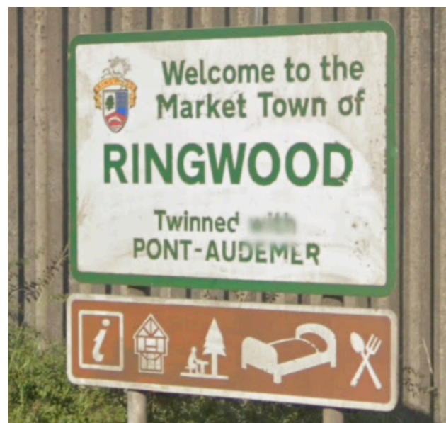
Marking the fact that the A31 passes through Ringwood (Westbound only)