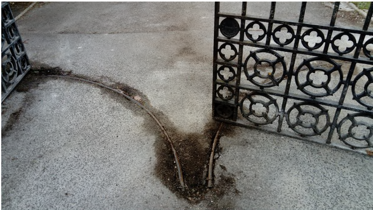
Figure 2 - Gates and wheel tracks