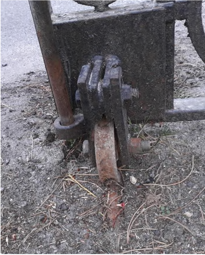
Figure 3- Gate supporting wheel (existing)