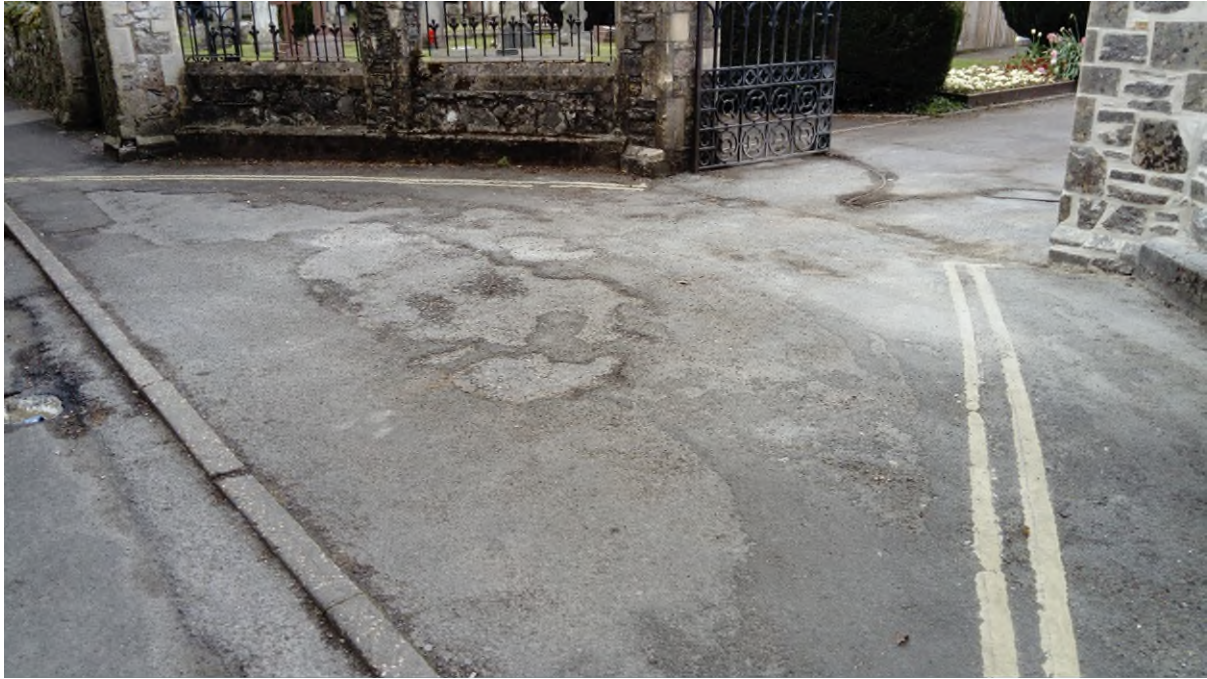
Figure 1 - Tarmac surface at entrance

Kelvin Wentworth, Grounds Foreman Direct Dial: 07918 615200 Email: kelvin.wentworth@ringwood.gov.uk