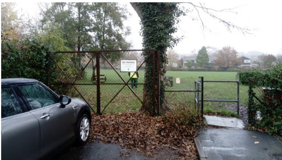
Figure 1 - Mature sycamore at North Poulner Play Area entrance

Kelvin Wentworth, Grounds Foreman Direct Dial: 07918 615200 Email: kelvin.wentworth@ringwood.gov.uk