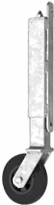
Figure 4 - Gate supporting wheel (proposed)